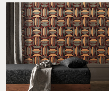
Resene Aquila Wallpaper Collection ILA303.

Wallpapers are best seen in person. View the full wallpaper collection at your local Resene ColorShop.