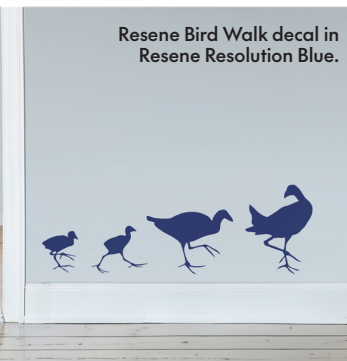
Resene Bird Walk decal in Resene Resolution Blue.