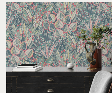
Resene Stories of Life Wallpaper Collection 39653-2.