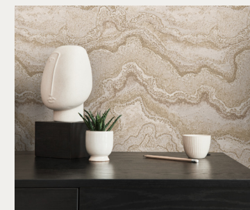
Resene Stories of Life Wallpaper Collection 39659-2.