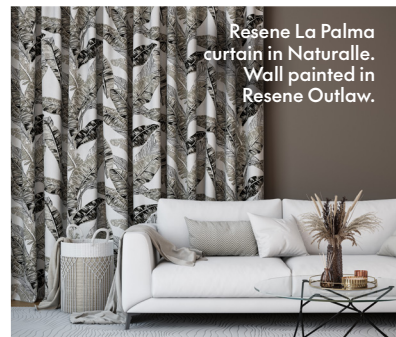
Resene La Palma curtain in Naturalle. Wall painted in Resene Outlaw.

Available from Resene ColorShops and selected resellers.