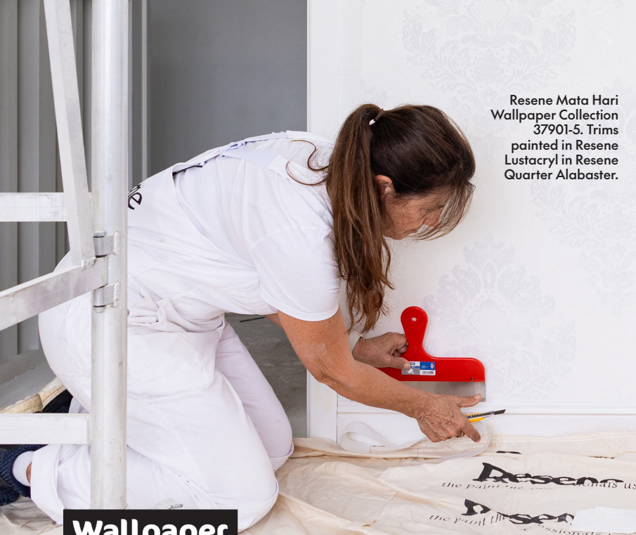
Resene Mata Hari Wallpaper Collection 37901-5. Trims painted in Resene Lustacryl in Resene Quarter Alabaster.