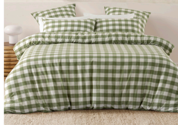
Wall painted in Resene Biscotti and Resene FX Paint Effects Medium mixed with Resene Quarter Biscotti.