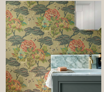
Resene V & A Wallpaper Collection 2311-170-03.