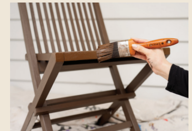
Chair is being primed with Resene Quick Dry waterborne primer undercoat (top) then painted with Resene Lumbersider Low Sheen in Resene Sambuca (above).