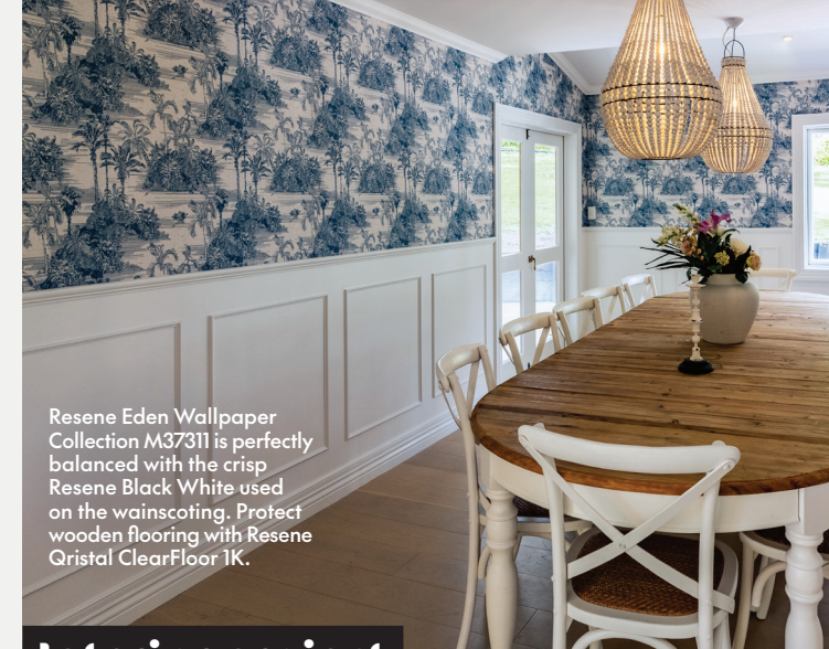
Resene Eden Wallpaper Collection M37311 is perfectly balanced with the crisp Resene Black White used on the wainscoting. Protect wooden flooring with Resene Cristal ClearFloor 1K.