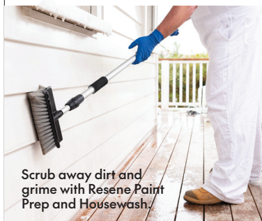
Scrub away dirt and grime with Resene Paint Prep and Housewash.

It's time to get rid of all the dirt and grime that can accumulate over winter. Doing this now will mean your house and outdoor areas will be primed and ready for al fresco entertaining and enjoyment in the warmer weather. Apply Resene Paint Prep and Housewash and give surfaces a good scrub. For any mould, apply Resene Moss & Mould Killer and wait for it to work its magic.