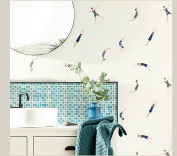
Resene Only Blue Wallpaper Collection ONB102696234.

Transform any room with the latest new Resene wallpapers