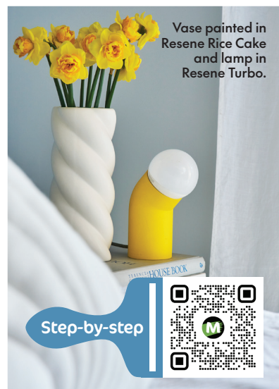
Vase painted in Resene Rice Cake and lamp in Resene Turbo.

Top tip: To get the best finish, make sure you load your paint roller with enough paint – it should resemble a hot dog dipped in batter.