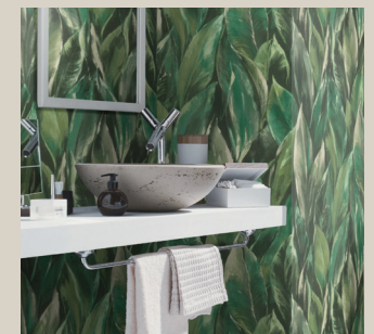
Resene Curiosity Wallpaper Collection 537345.

Wallpapers are best seen in person. View the full wallpaper collection at your local Resene ColorShop.