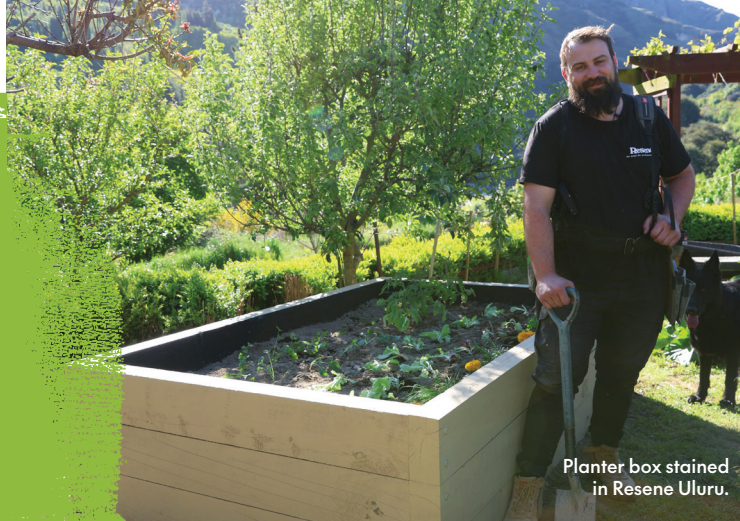
Planter box stained in Resene Uluru.

Building a planter box is the DIY project that keeps on giving. With the cost of groceries at an all-time high, get outdoors and keep busy by growing your own fruit, vegetables and flowers. This is the perfect spring weekend project – nothing tastes quite as good as something you've grown yourself!