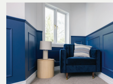
Making your own wainscoting is a simple way to add character to your home. Wainscoting painted in Resene Bunting, walls and trims in Resene Black White.