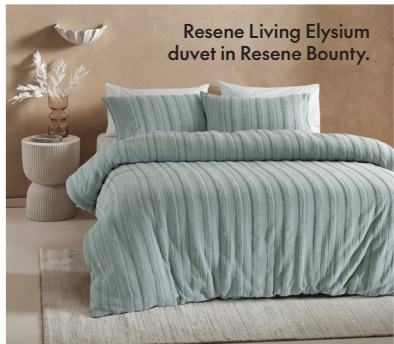
Resene Living Elysium duvet in Resene Bounty.

View online at www.resene.com/walld decals and order at Resene ColorShops.