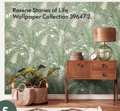
Resene Stories of Life Wallpaper Collection 39647-2.

This guide has general information for a range of projects – check with Resene ColorShop or reseller staff for advice for your project. Colours shown are a representation only. Please refer to the actual paint or product sample before making your final choice.