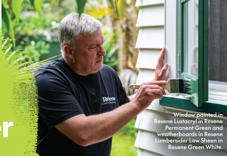
Window painted in Resene Lustacryl in Resene Permanent Green and weatherboards in Resene Lumbersider Low Sheen in Resene Green White.

The sun is shining, so roll up your sleeves and get stuck into these weekend DIY jobs and fun paint projects.