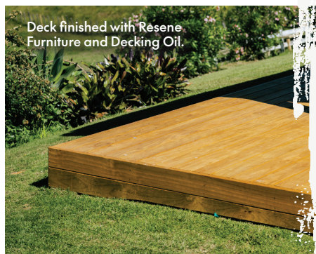
Deck finished with Resene Furniture and Decking Oil.

Top tip: Deck stains generally need a maintenance coat every two to three summers.