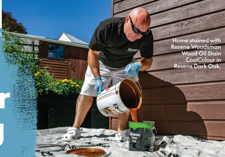
Home stained with Resene Woodsman Wood Oil Stain CoolColour in Resene Dark Oak.

Using stains to refresh your home, outdoor living areas and fences is the perfect job to get done while the weather is warm.