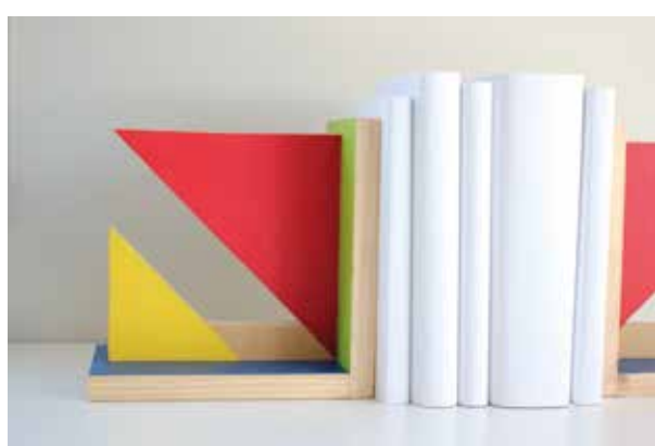
Resene colours used: Smashing, Whale Tail, Spotlight and Limerick