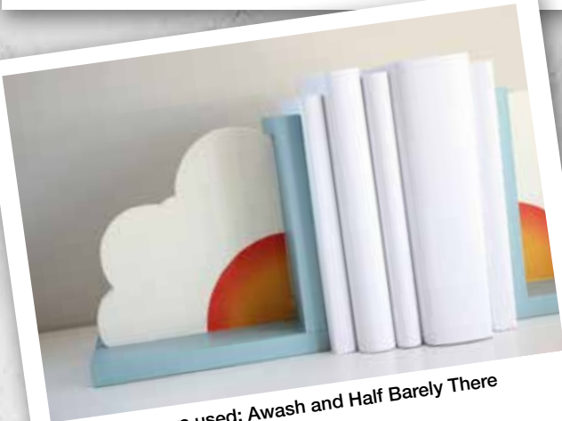
Resene colours used: Awash and Half Barely There