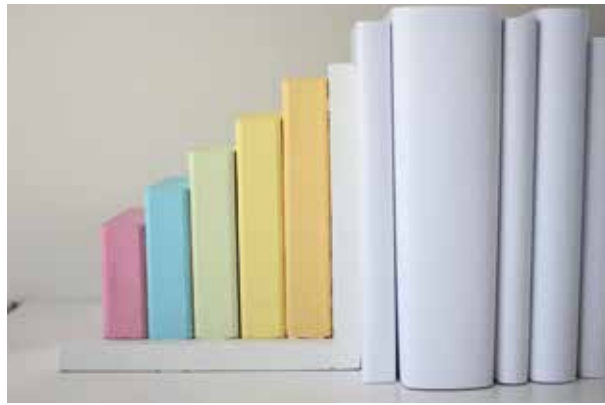
Resene colours used: Azalea, French Pass, Apple Green, Pale Prim and Buttermilk