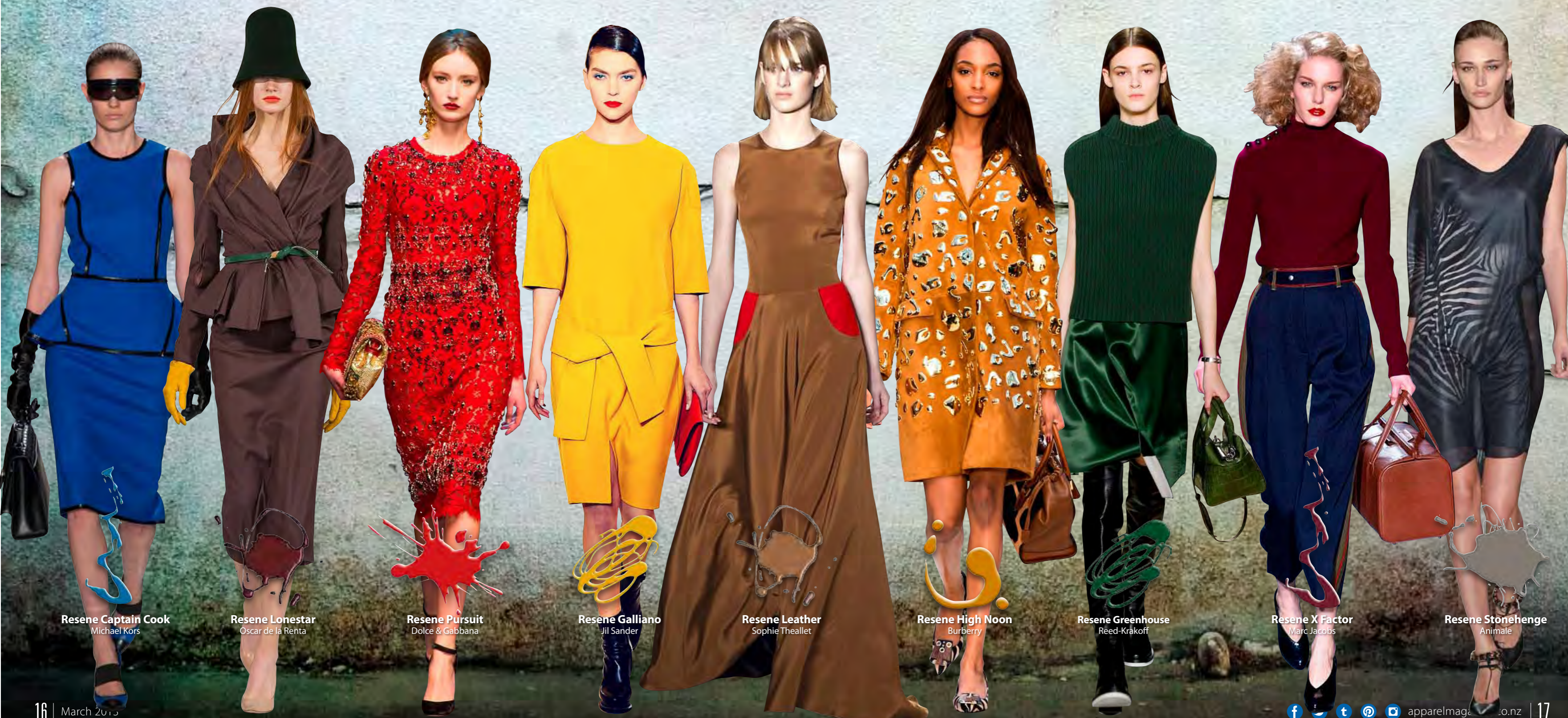
Resene Captain Cook Michael Kors