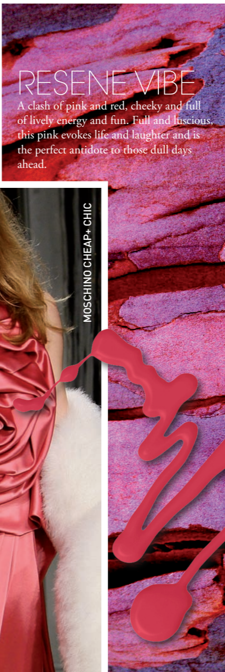
MOSCHINO CHEAP & CHIC

A clash of pink and red, cheeky and full of lively energy and fun. Full and luscious, this pink evokes life and laughter and is the perfect antidote to those dull days ahead.