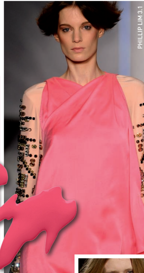
PHILLIP LIM 3.1

A wayward hot pink with considerable personality. This pink is not for the shrinking violets. Bold, flirtatious and in your face, Resene Miss Hussy is a knock out pink hue.